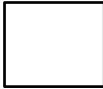
Grey nurse shark tooth